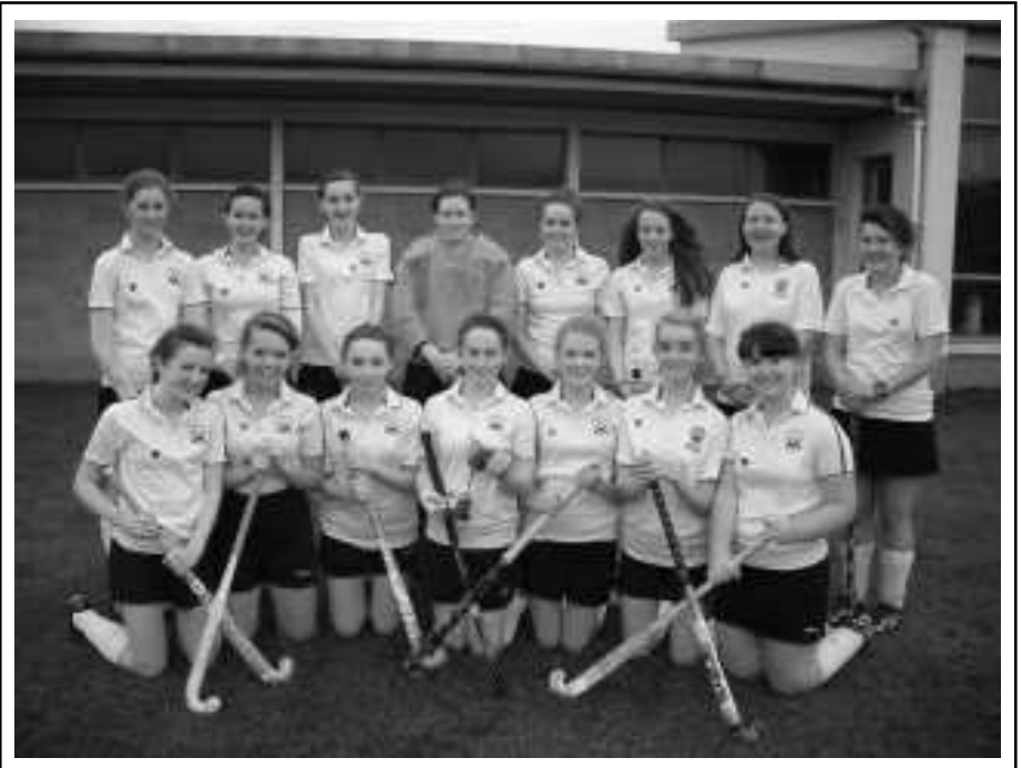
S3 Girls Hockey Fife Champions pictured at Station Park