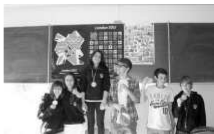
A class 'choc' full of medal winners!

With a view to entering an Olympic competition organised by the UK-German Connection, the 55th Kiel-Madras Exchange group took part in a number of Olympic related activities when in Kiel in June. On our return from the October break we were delighted to find out that we had been awarded a bronze award (£500). We are the only Scottish school among the prizewinners. Our activities are showcased on the UK-German Connection website ( www.ukgermanconnection.org/olympics-competition-results ).